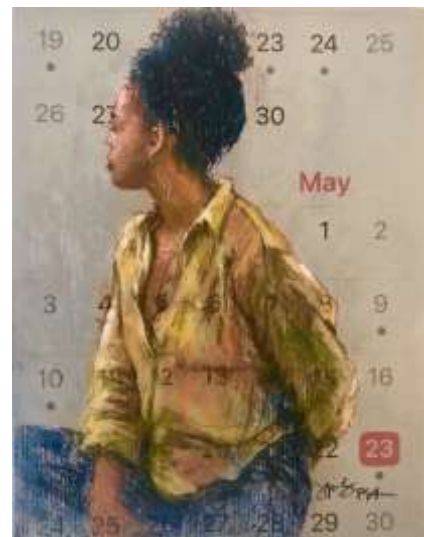
“All the Days are the Same”