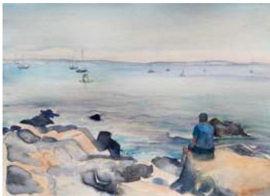
"At the Sound"

TERRY SCHWARZ Over the past several months she and her husband have been taking quiet walks by Long Island Sound in Larchmont, NY. It has been relaxing to try to record these serene images upon returning home. They are still home most of the time and enjoy sitting in the garden. The hydrangeas and hibiscus have found their way into Terry's watercolors. Their apple tree was the inspiration for a recent instructional video she created for teenagers to learn how to draw