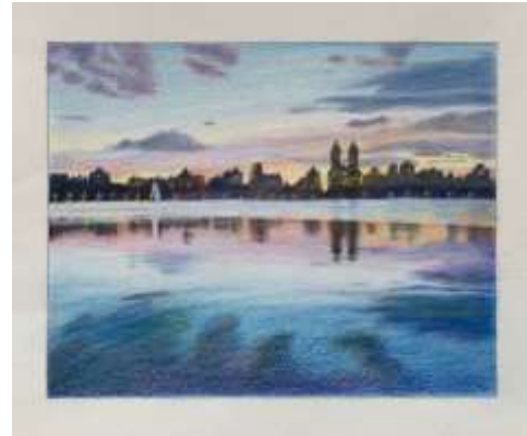
"Summer in the City"