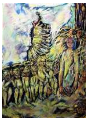
"Angel Receiving Wings"