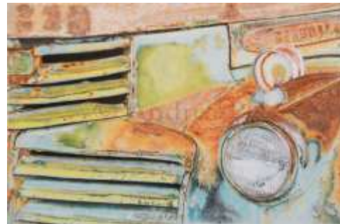
"Rust and remembrance"