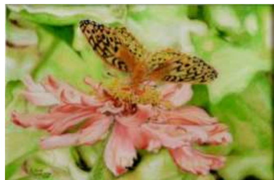
"Stop and Sip"