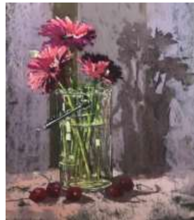
“Glass and Shadows”