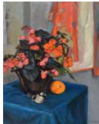
"Covid Still Life"