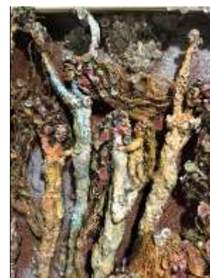
"Family Birch-close up"