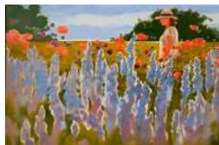
"Larkspur and Poppies"

Celebrating 50 Years of Fine Art in the Lowcountry.