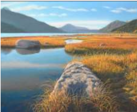
"Autumn tidal Flats on the Chilkat River"

DONNA CATOTTI has been accepted into PSWC's 34TH Annual PASTELS USA International Open Exhibition for her painting "Autumn Tidal Flats on the Chilkat River." The show opens online Sept. 20, 2020.