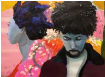
"Delft and Indigo II" - Acrylic