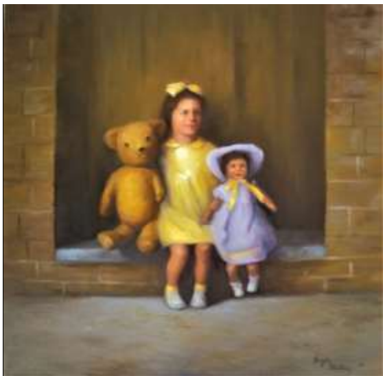
"As Big As Me"