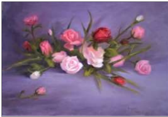
"My Favorite Flower"