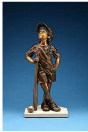
"High Hopes II"