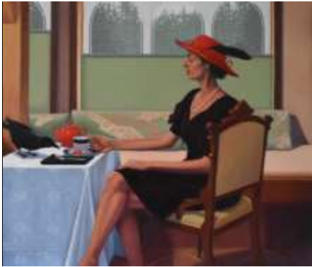
"One Hundred and Ten Years Later"