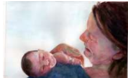
"Your Mama has to be Gone"