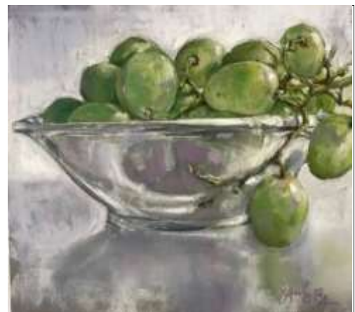
"Last Bowl of Grapes"