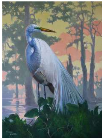
“The Great Egret”