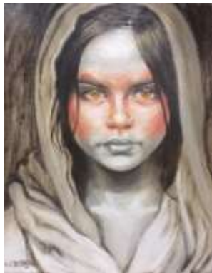
"Eyes Wide Open"