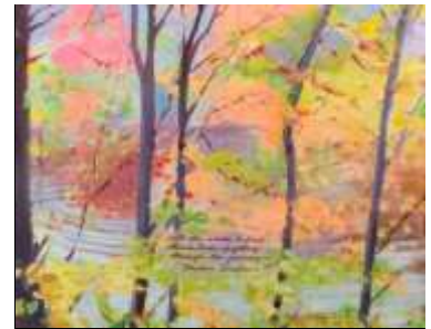
"Into the Woods"