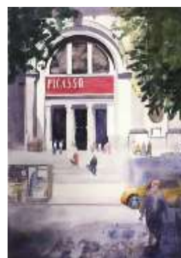
"Picasso at the Metropolitan"