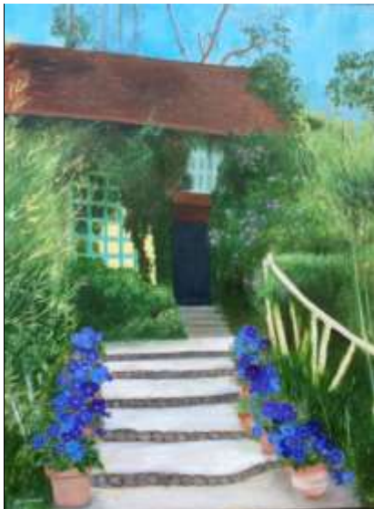
"Gaudy Hotel, Giverny, France"

JANET LIPPMANN - I have just completed this oil painting of the Gaudy Hotel Garden in Giverny, France. (36"x30") I'm also drawing each flower as it blooms in our small garden starting with the daffodils and now the lilacs and allium. Really concentrating on one flower at a time is especially soothing and a constant reminder of how lucky we are to have so much beauty close by during these difficult times.