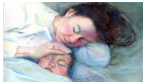
"Love You Are Born"