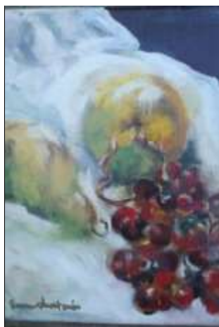
"Juicy Fruit" – Acrylic