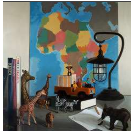
“African Safari Dreams”